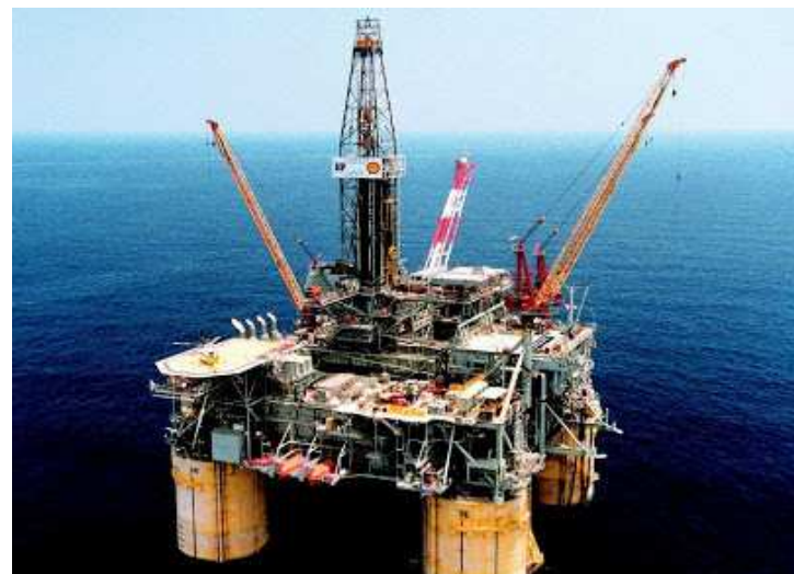
nanoSAT™ remote cell sites