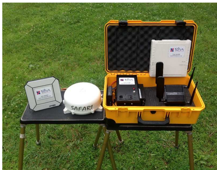
nanoSAT™ 3G system shown